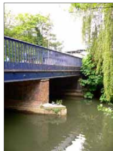
Hythe Bridge, seen from the road with remaining section of iron parapet, and from the river