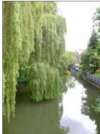
Castle Mill Stream, above (left) and below Hythe Bridge