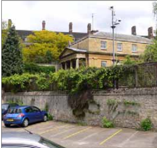
The Wharf House seen from the south