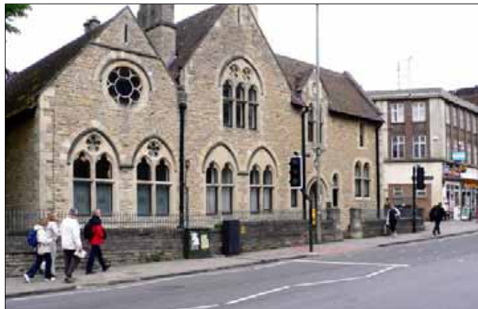
The Probate Registry on New Road

Listed buildings Probate Registry Grade II