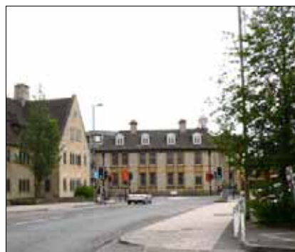
Nuffield College and the County Offices, looking along Worcester Street