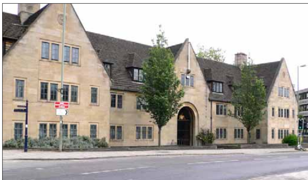
Main (west) front of Nuffield College, looking across Worcester Street from the Car Park