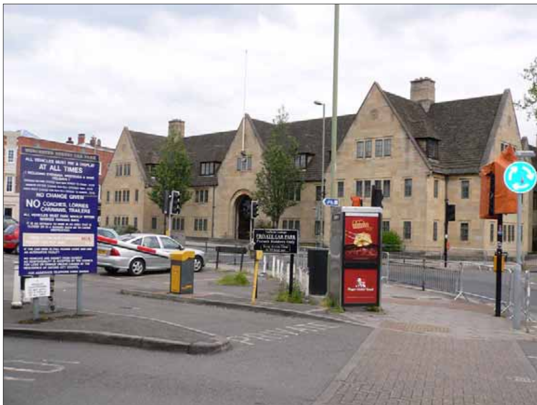
Nuffield College, Worcester Street and Car Park