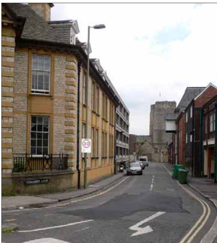
Tidmarsh Lane, the rear of Macclesfield House to the left, beyond the 1911-14 County Offices