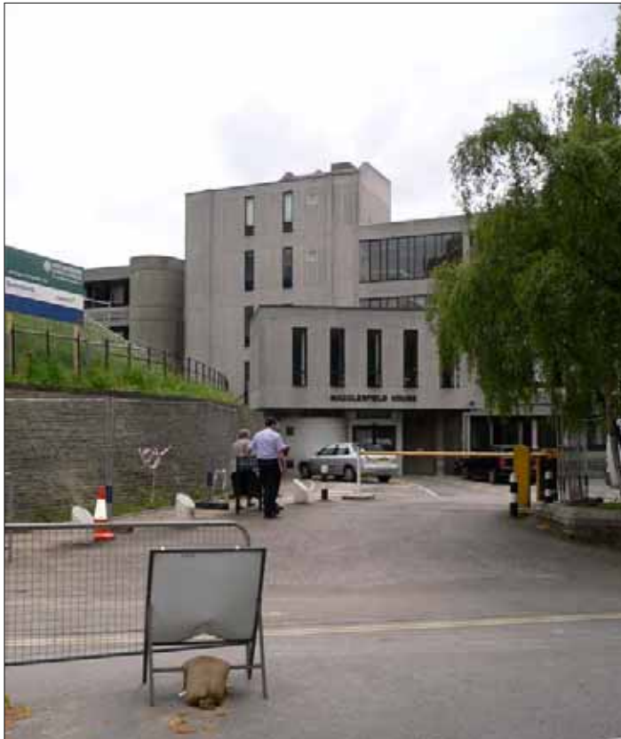
Macclesfield House, the forecourt off New Road