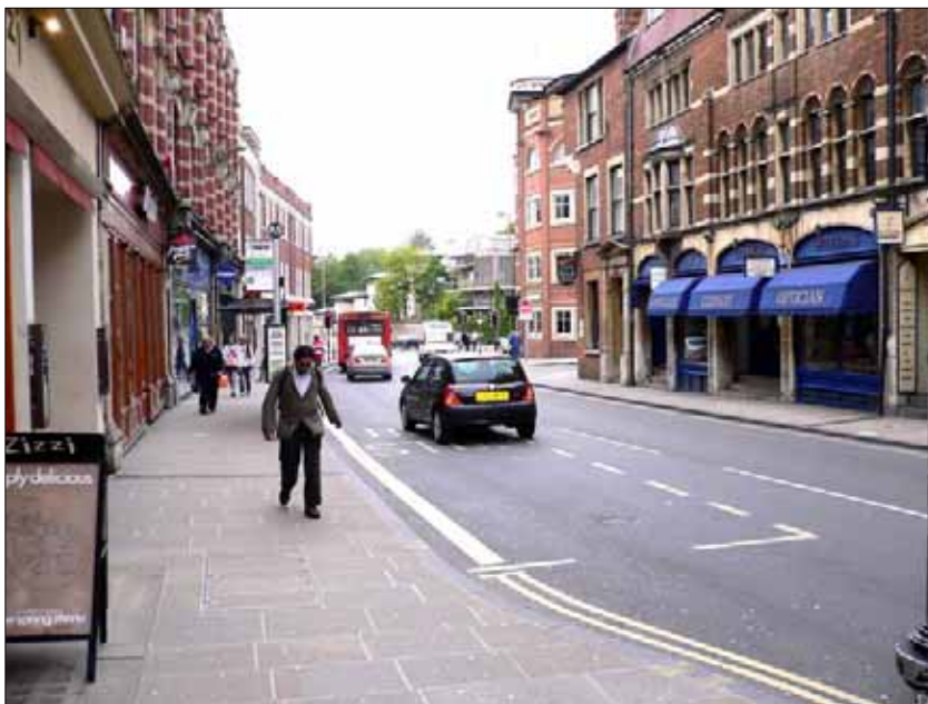
South end of George Street, looking towards Hythe Bridge Street and the Worcester Street crossroads

Wyaston House, St Peter's College Grade II Wesley Memorial Methodist Church Grade II War memorial in Bonn Square St Peter le Bailey church (St Peter's College Chapel) Central Girls' School