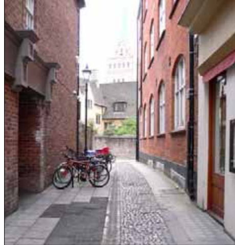
George Street Mews, eastern end