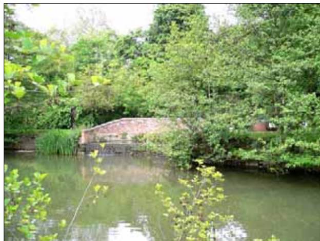
The weir west of Hythe Bridge, replacing the flash lock initially built in this position to allow boats to transfer between Canal and Castle Mill Stream