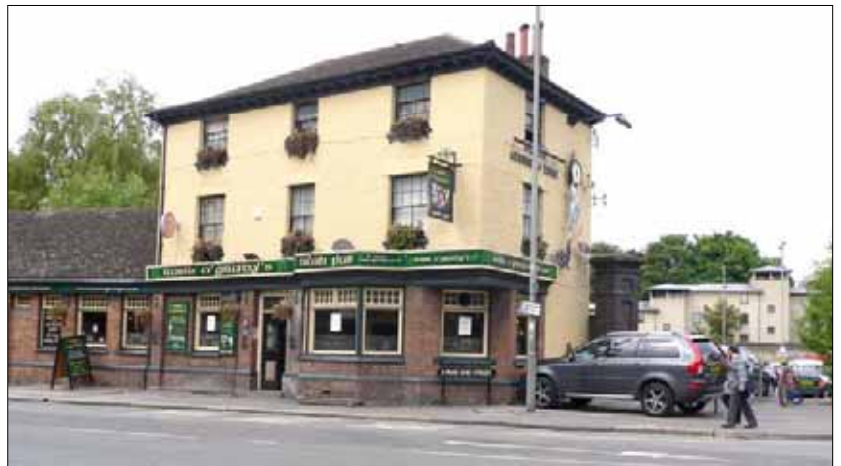
Left: County Offices at corner of New Road and Tidmarsh Lane Right: Rosie O'Grady's Irish Pub, at corner of Worcester Street and Park End Street